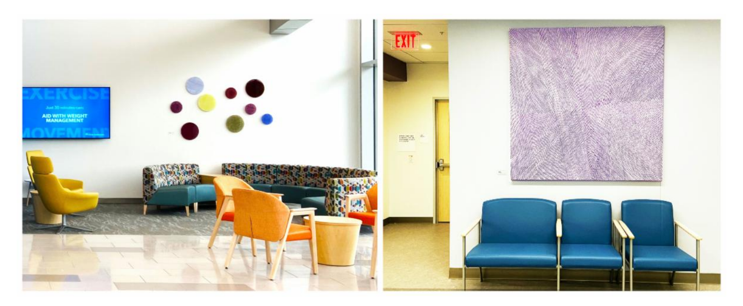
Works from left to right: Bloom and Lilac Aura by Mel Prest

At the stairs between the welcome lobby and second floor lobby is an acrylic installation by former Bay Area artist Melissa Borrell, entitled Raining Down Color . The piece picks up light from the lobby's two-story windows, and it's dynamic form invites users up the stairs to the second level of the building.