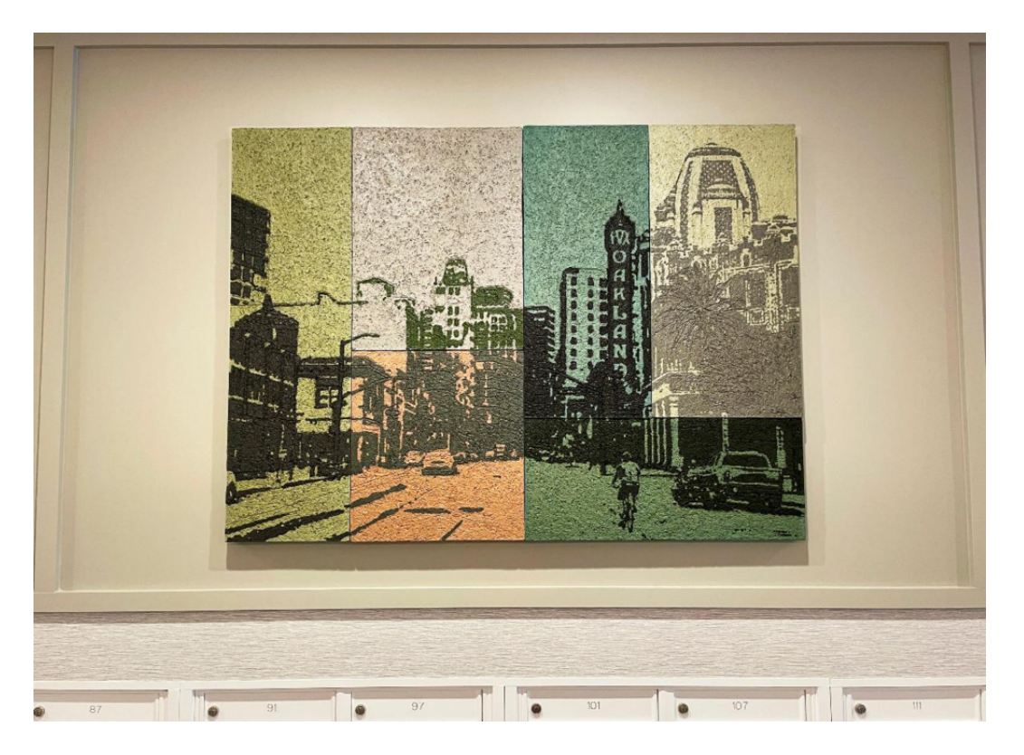
Artwork by Kwadwo Otempong

Many works such as the one above by Kwadwo Otempong , were selected or created with the site and Oakland context in mind. Otempong's materials are recycled pulped cardboard, pigment, and glue on canvas, creating a dynamic work that stands out among the collection.